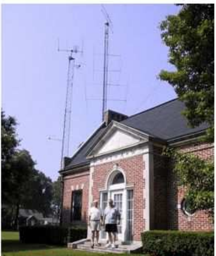
W1AW transmitter building

* If we do not meet a 30 person minimum your money will be refunded in full.