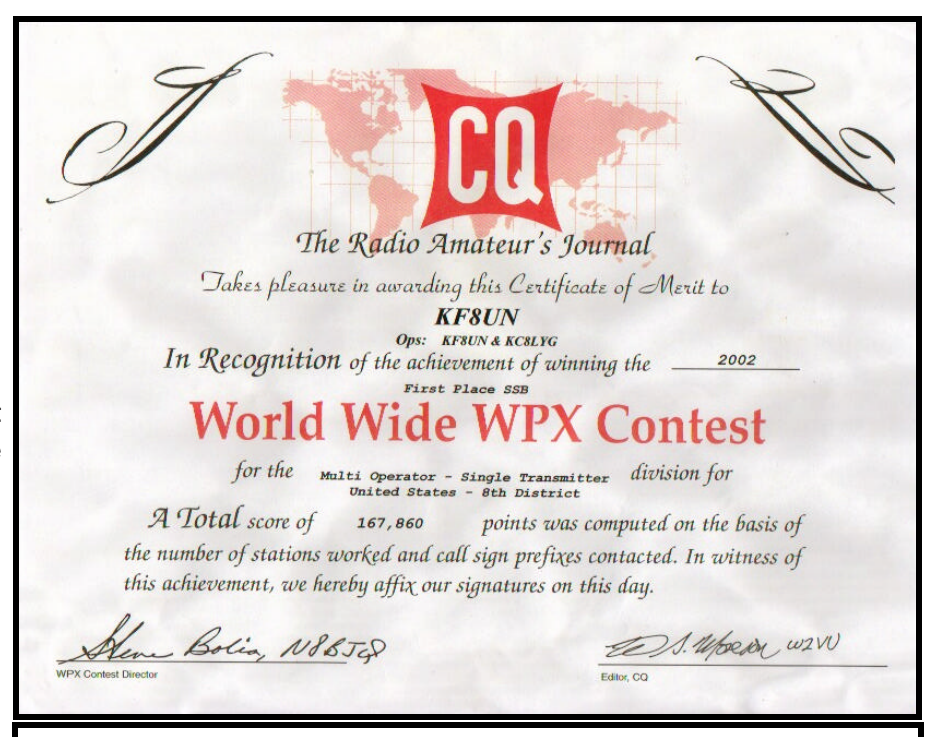
KF8UN and KC8LYG win 1st Place 2002 WWWPX in 8th area.

granting of a band segment at 5 MHz came last year from the National Telecommunications and Information Administration (NTIA), which cited the ongoing spectrum requirements of federal power at 50 W ERP and said it government licensees having homeland security responsibilities. The NTIA administers