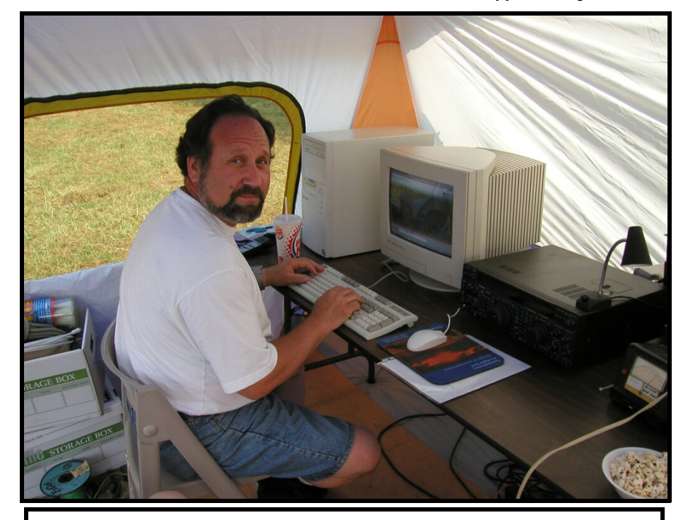
Proof: KB8NW DOES operate on Field Day!